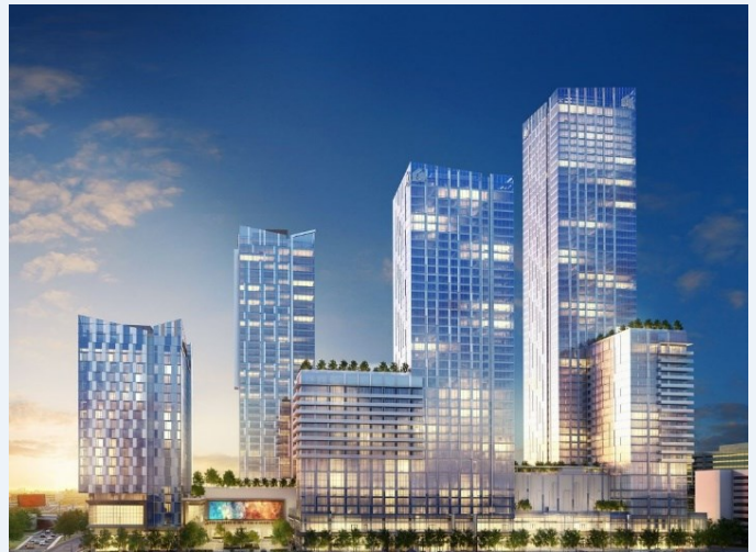
Metropolis courtesy of Gensler

Not only will Metropolis add a substantial presence to our expanding downtown skyline, but it will help connect the financial district to the north and the entertainment district to the south. A full buildout of the project includes more than 1,500 condominiums, a 350-key Hotel Indigo and more than 70,000 square feet of commercial space. Phase II of construction is slated for completion in 2019.