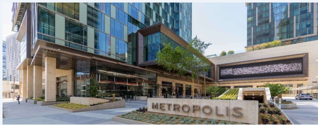
Metropolis courtesy of AECOM

Located along Francisco Street, the main entrance faces East with the “METROPOLIS” sign placed visibly near the driveway entrance. Anyone passing by may be captivated by the 100-foot-wide LED wall that’s been built along the exterior of one of the buildings. Greenland USA, a leading developer of modern and transformative properties, along with Isenberg & Associates, Inc., partnered with StandardVision to design, manufacture, and install the new 1,400-square-foot, transparent LED video display as part of its public art installation.