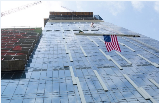
Tower III Topping Off

As the tower crane lifted the last steel beam into place, attendees watched in patriotic fashion with the American flag hanging from the structural member. The topping off of the fourth and final building marked a major milestone for the $1-billion Metropolis Development in Downtown Los Angeles. Metropolis is a mixed-use development consisting of residences, hotel and retail in the heart of downtown Los Angeles.