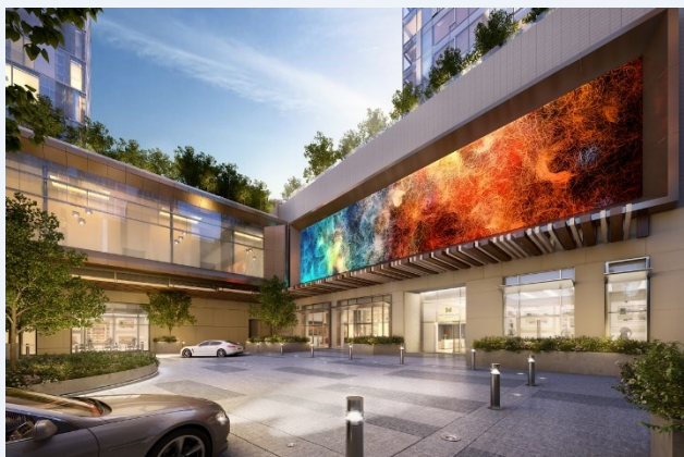
LED wall

The giant wide-screen uses historical and live data from various sources including RSS feeds, weather activity, and transportation information to create a living portrait of the city. It contains 435,200 LED lights and took more than 20,000 hours of work over the course of three years to complete.