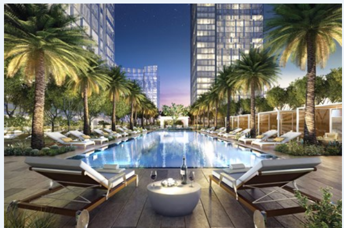
Residence Clubhouse

Tower II topped off in October 2016 at 40 stories high. It will offer a 1.5 acre sky park, a resort-style pool and similar amenities found in Tower I. The residence club will offer lounge, screening room, fitness center, steam rooms, yoga studio and meditation garden.