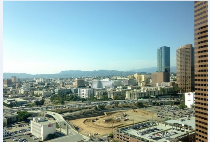
Metropolis site

The entire Metropolis project, with a total of four towers, is designed by global architect firm Gensler. Gensler's design approach is creating a contemporary, urban living environment developed in a series of evolving towers. The project consists of two phases.